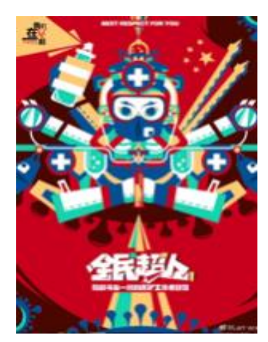
Figure 3 Figure 4