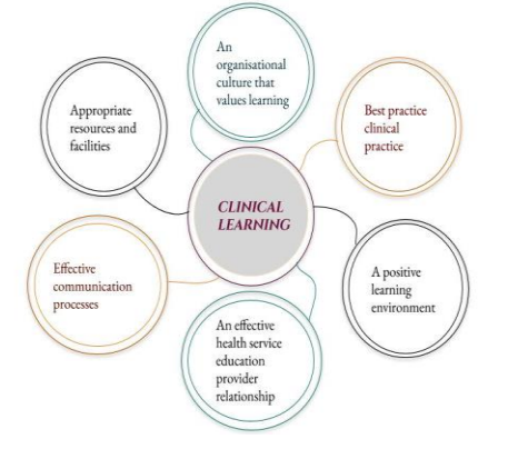
Figure 3. Different aspects of clinical learning of palliative care.

Complementary therapies encompass a diverse range of interventions, including physical, psychological and pharmacological therapies. Therapies may be considered as self-care approaches (meditation, for instance), as techniques (massage) or as interventions with a range of clinical. applications (Avurveda, homoeopathy, etc.). All are used i this context in addition to, rather than in place of, orthodo 2. cancer treatments to help with symptom control and t enhance general wellbeing. The most extensively used b3. patients with cancer are the touch therapies (aromatherapy reflexology and massage) and psychological intervention4. (relaxation, meditation and visualisation). Patients wit cancer may access complementary therapy services from variety of sources in the statutory, voluntary and independer 5. sectors. They are delivered in settings such as genera practices, hospitals, hospices and diverse community locations, including self-help and support groups.