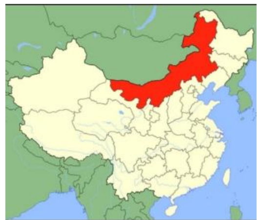
Figure 1: Map of Inner Mongolia (marked red)

As the third biggest province in China, Inner Mongolia Autonomous Region (shorten as Inner Mongolia) lies in northern China, bordering Heilongjiang, Jilin, Liaoning and Hebei in the northeast, Shanxi, Shaanxi and Ningxia in the south, Gansu in the southwest, and Russia and Mongolia in the north, spanning the northeast, north and northwest regions. The border of the Inner Mongolia Autonomous Region stretches for 4,200 kilometers, with a total area of more than 1.18 million square kilometers. More than half of its land is covered by grasslands and forests [1] . There are more than 25 million people from 55 national groups including Mongolian, Han, Manchu and Hui living here. It is the earliest province whose majority is Mongolian. Inner Mongolia is the birthplace of China's ethnic regional autonomy system.