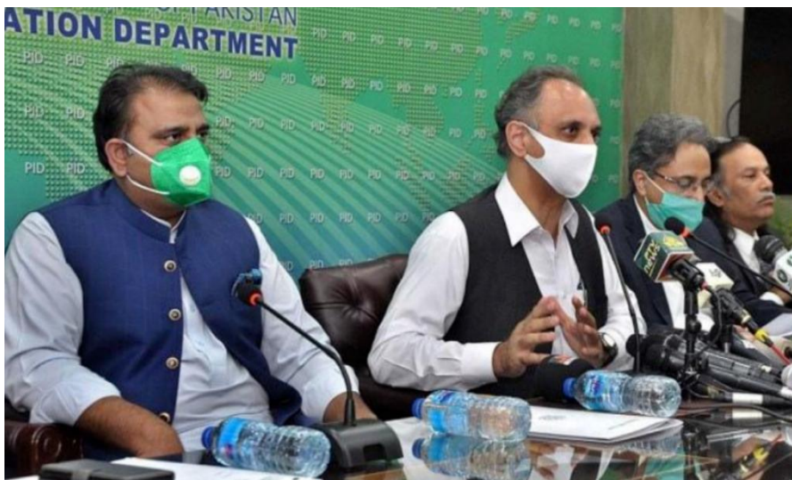
Figure 4: Minister for Energy Omar Ayub Khan said the policy is to increase the share of renewable energy to 60 percent by 2030.

Pakistan attaches great importance to digital technology and green economy. In 2018, Pakistan introduced 'Digital Pakistan policy, which aimed to bolster the IT industry by building a digital ecosystem. Taking a step forward PM Imran Khan launched a 'Digital Pakistan Vision' in December 2019 with an aim of enhancing connectivity, improving digital infrastructure, increasing investment in digital skills, promoting innovation, and tech. entrepreneurship [6] . On August 6, 2020, the Council of Common Interests (CCI), Government of Pakistan, , approved the Alternative and Renewable Energy (ARE) Policy 2020 that offers generous tax facilities to investors and promises induction of power plants on open competitive bidding for lowest tariff and technology transfer. This policy is to expanded scope to all alternative and renewable energy sources, competitive procurement and addresses areas like distributed generation systems, off-grid solutions, B2B methodologies and rural energy services [7] . CPEC has solved the energy crises in Pakistan and the basic infrastructure of the nation has been improved greatly. There is no doubt that the two countries will seek new collaborative opportunities for development in these areas.