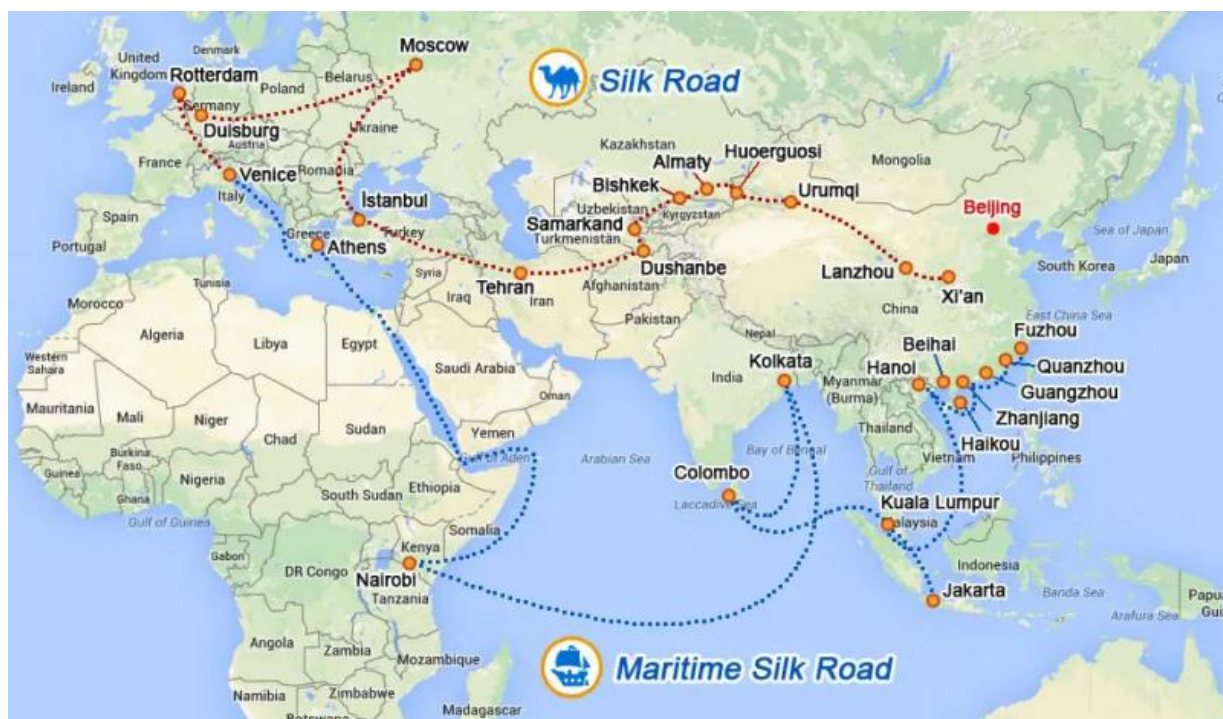
Figure 1: map of BRI

The Belt and Road Initiative (BRI) is short for Silk Road Economic Belt and the 21st Century Maritime Silk Road. Also known as “one belt, one road”, it is a transnational economic zone initiated and led by People's Republic of China in 2013. It covers the countries and regions along the Silk Road and Maritime Silk Road that historically passed through China, Central Asia, West Asia, the Indian Ocean coast and the Mediterranean coast.