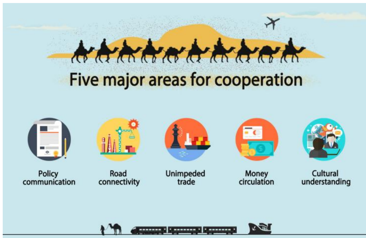
Figure 2: Five major areas for BRI Cooperation

the continents of Asia, Europe and Africa, connecting the vibrant East Asia economic circle at one end and developed European economic circle at the other, and encompassing countries with huge potential for economic development. Initiated by China, BRI is serving the people of the globe, who are different in historical traditions, cultures and beliefs, and social systems and lifestyles. Despite many challenges, it aims to promote peaceful development and economic cooperation, instead of forming a geopolitical or military alliance.