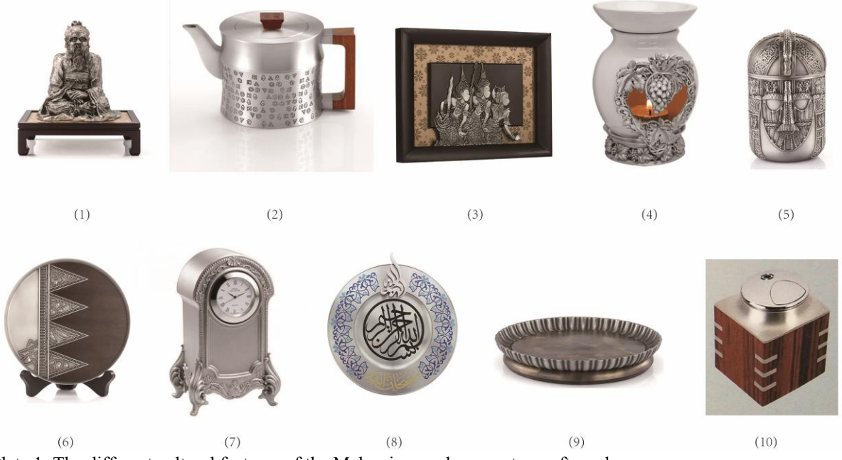
Plate 1: The different cultural features of the Malaysian modern pewter craft works.

Pewter is made primarily from tin metal; the fourth most precious commercially traded metal after gold, silver and platinum (Cosi Tabellini 2022). The pewter craftwork encompasses the majority of all categories, e.g. living, dining, celebration, and so on, in the light of the habit of modern pewter crafts industry and author's record and collection, referring to the number of crafts amount to about over 500 pieces. There is a detailed analysis of ten judgmental Malaysian modern pewter crafts which are chosen from these craft works collected.