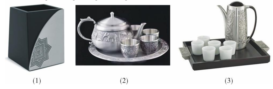
Plate 2: The three samples of Malaysian modern pewter craft works.

4. Different cultural elements are incorporated into pewter craftwork through the way of combining pattern, shape and connotation of different cultures. The multicultural elements will be transformed into rich forms of pattern, shape and connotation, and are combined together creatively according to certain primary and secondary principles. Following are three samples can give a specific explanation.