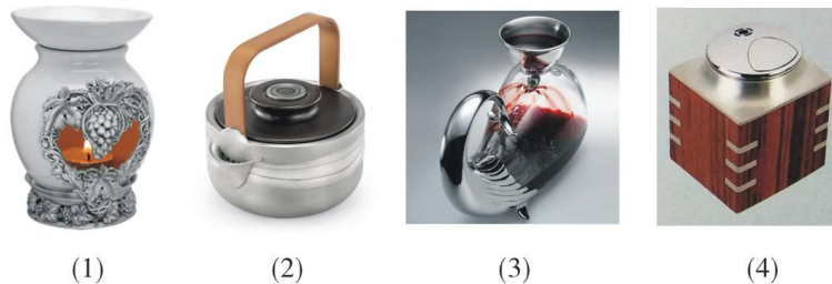
Plate1: The Malaysian pewter craft works of the different materials combination.

In traditional pewter craftwork, the pewter is the main or unique material; all craft and design are beneficial to showing the pewter’s character. But in Malaysian modern pewter craftwork the combination among different materials is a common form, different materials as pewter, wood, glass, ceramics, bamboo, complementing each other, which broaden the expressiveness and design thought of traditional pewter craftwork. There are four representative samples came from many local pewter craft works, which can show this feature with a further description.