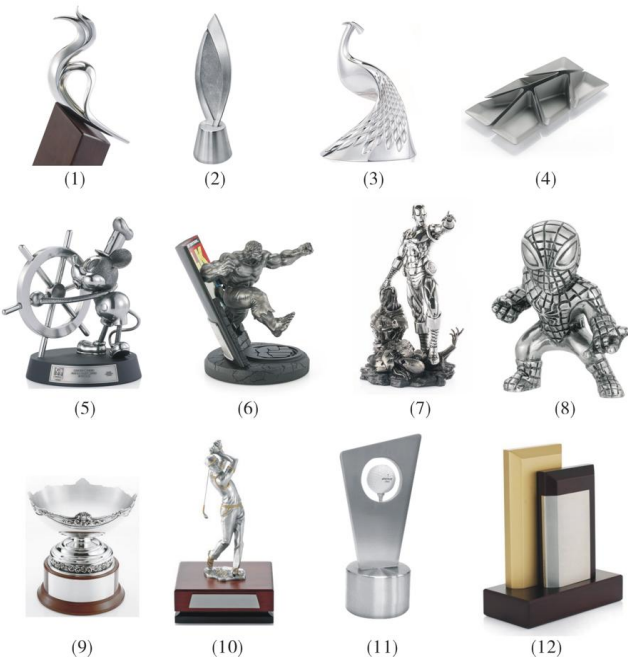
Plate3: The Malaysian pewter craft works of the modern and popular cultural features.