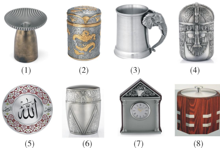
Plate2: The Malaysian modern pewter craft works of the different cultural features.

Relative to traditional making-pewter countries, Malaysian modern pewter craftwork shows rich cultural features. The various cultural elements are from the East and the West, from the traditional forms to modern styles. It is a apparent feature of Malaysian modern pewter different with pewter of those monoculture countries. Different cultures can inspire rich design thoughts of Malaysian pewter craftsmen, different cultural elements, shape, patterns and crafts are a common phenomenon in Malaysian modern pewter craftwork, which satisfies the need of different national people.