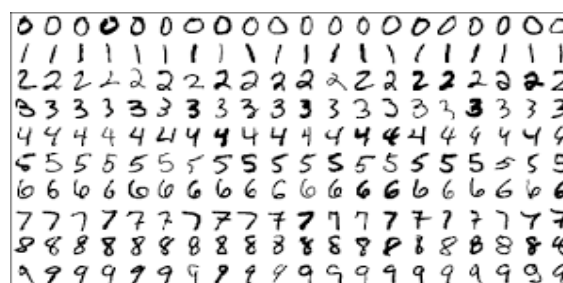
Figure 1 sample of handwritten digits

supervised learning methods used for classification and regression.